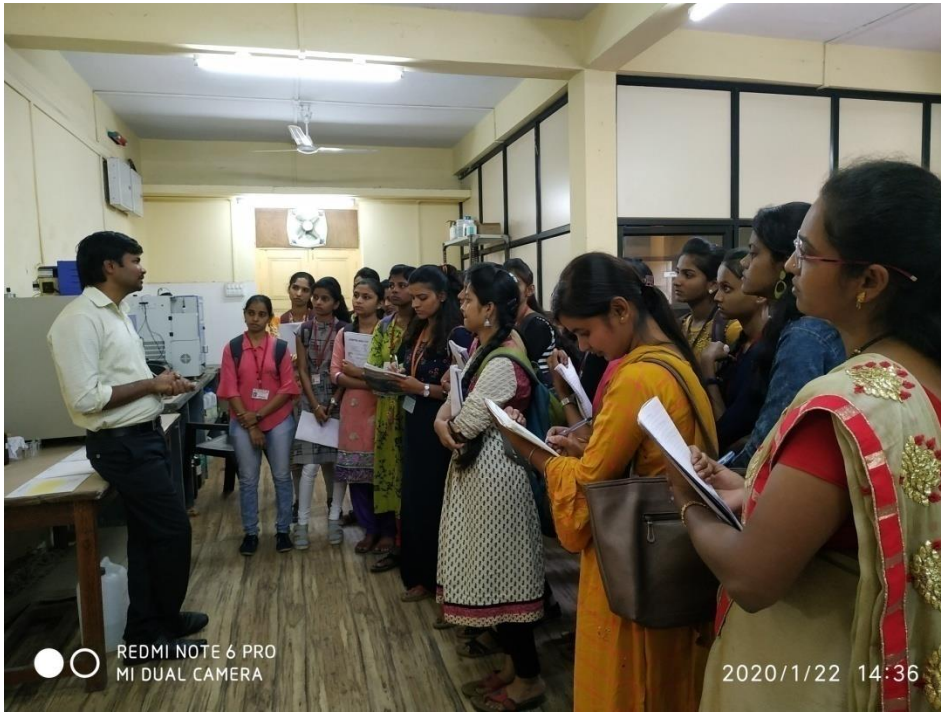
Photo –Regional Forensic lab, Kolhapur visit of B.Sc III students