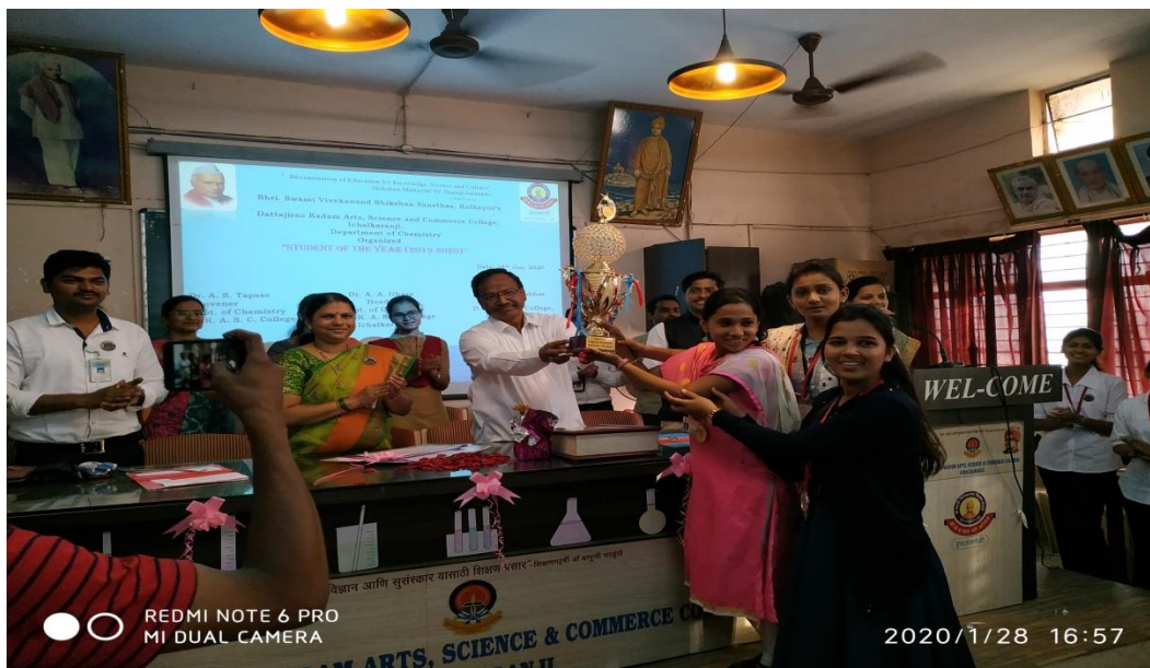
Photo – Student of the year (2019-2020) competition