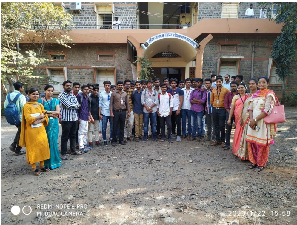
Photo - Regional Forensic lab, Kolhapur visit of B.Sc III students