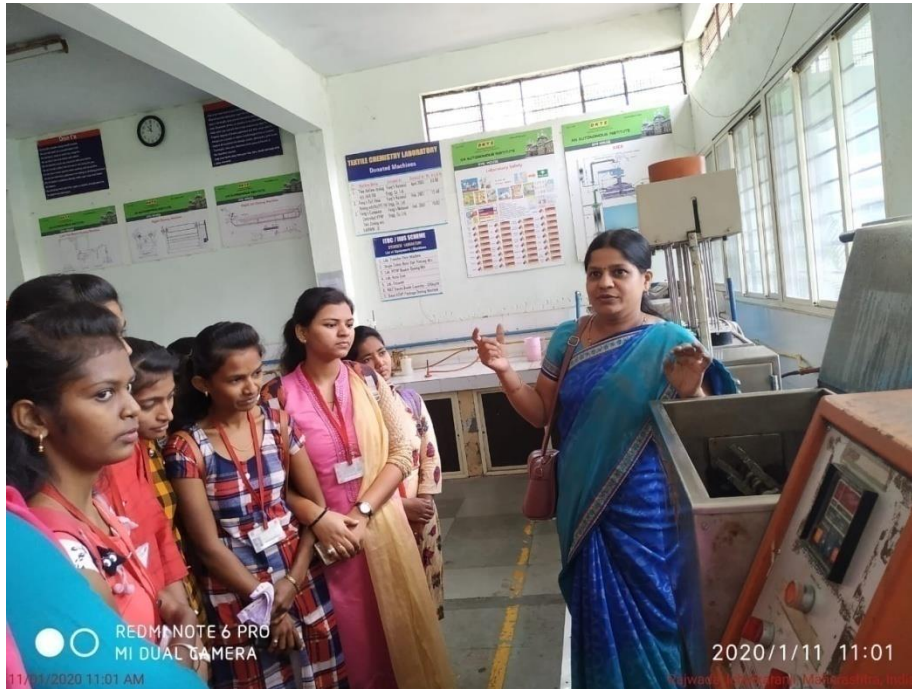
Photo –DKTE institute of textile and engineering, Ichalkaranji visit of B.Sc III students