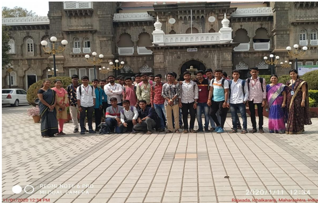
Photo - DKTE institute of textile and engineering, Ichalkaranji visit of B.Sc III students