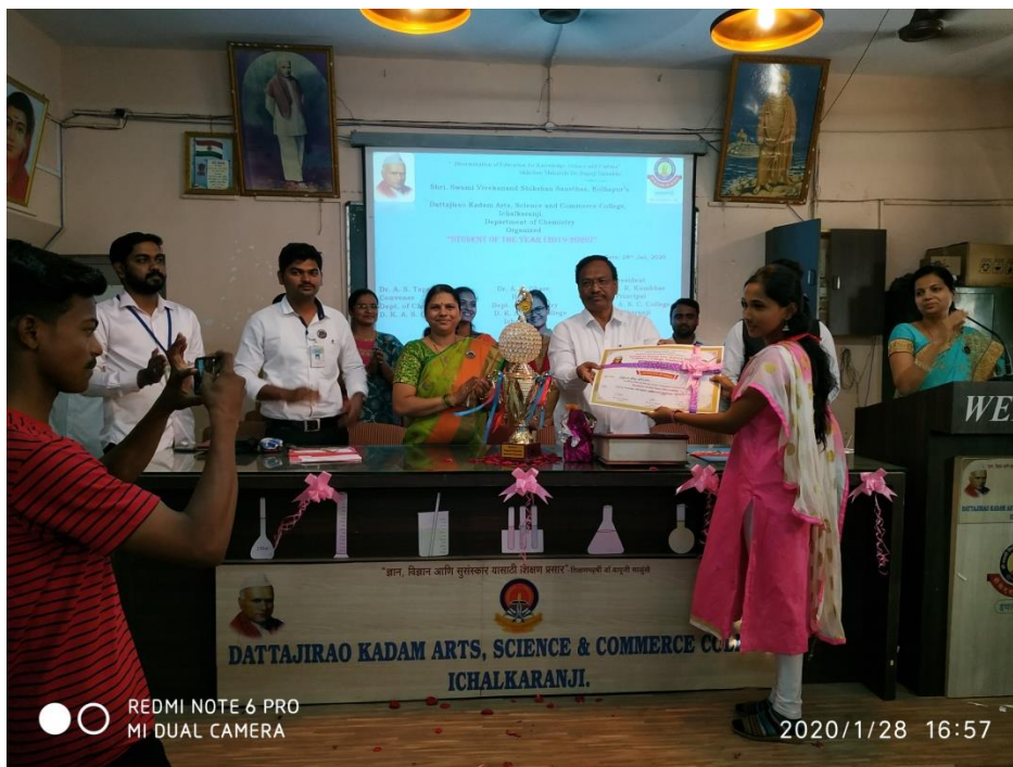
Photo – Student of the year (2019-2020) competition