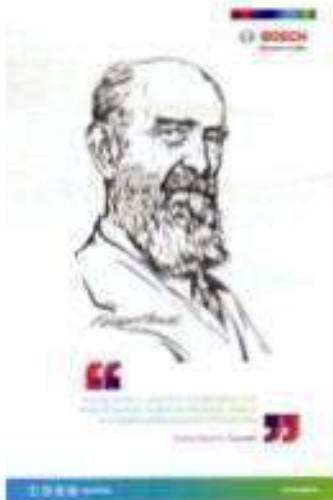
Poster No 2