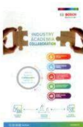
Poster No 5