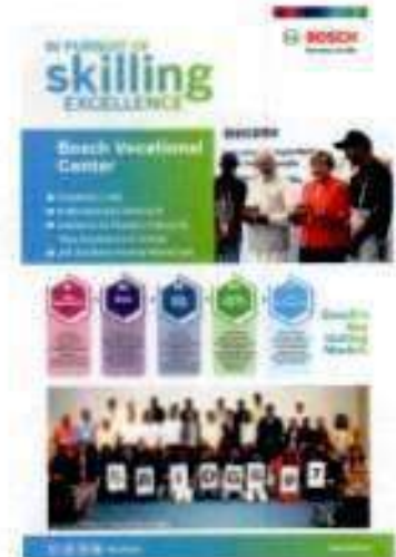
Poster No 4