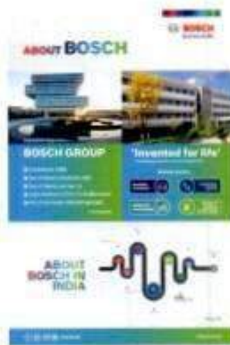
Poster No 3