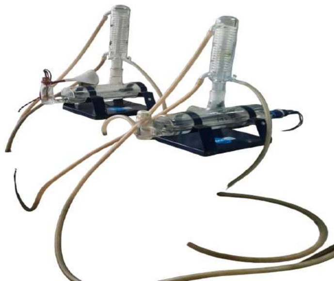
Double Distilled Water Plant