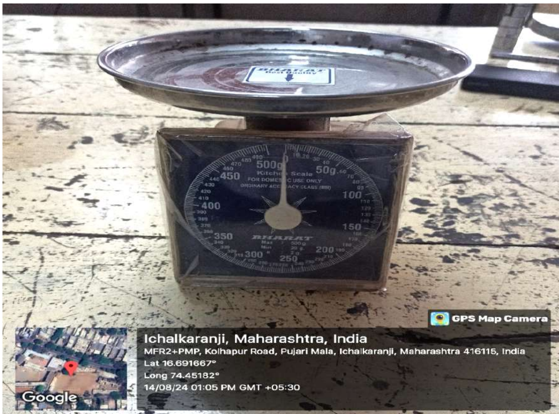
Analog Weighing Balance