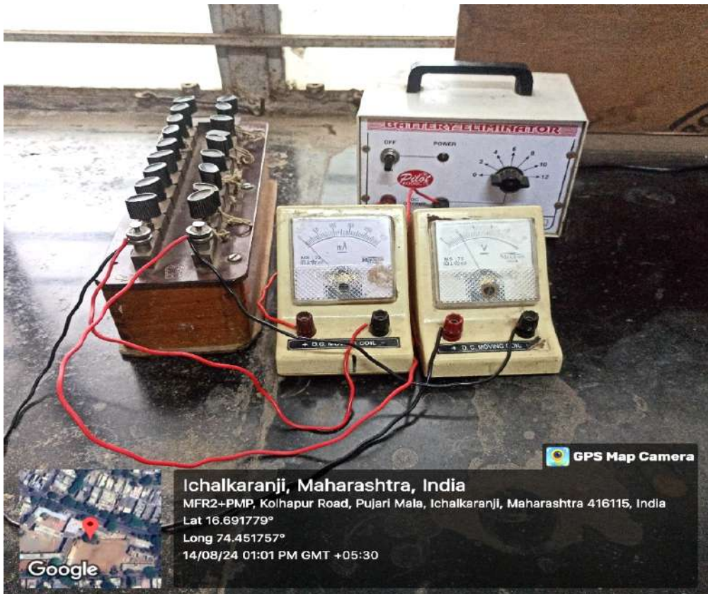
Experimental Setup of Ohm's Law