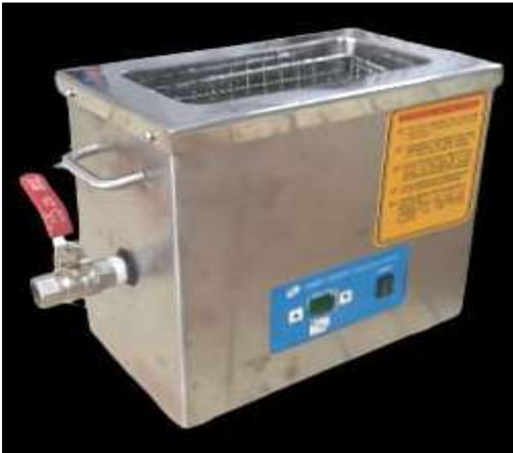
Ultrasonic Sonicator Bath