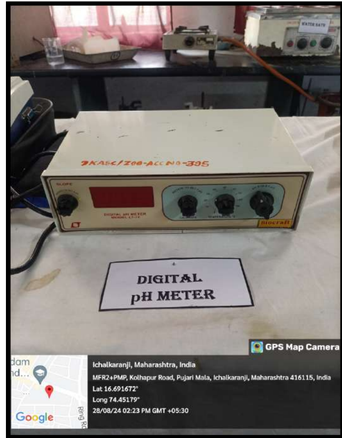
DIGITAL PH METER