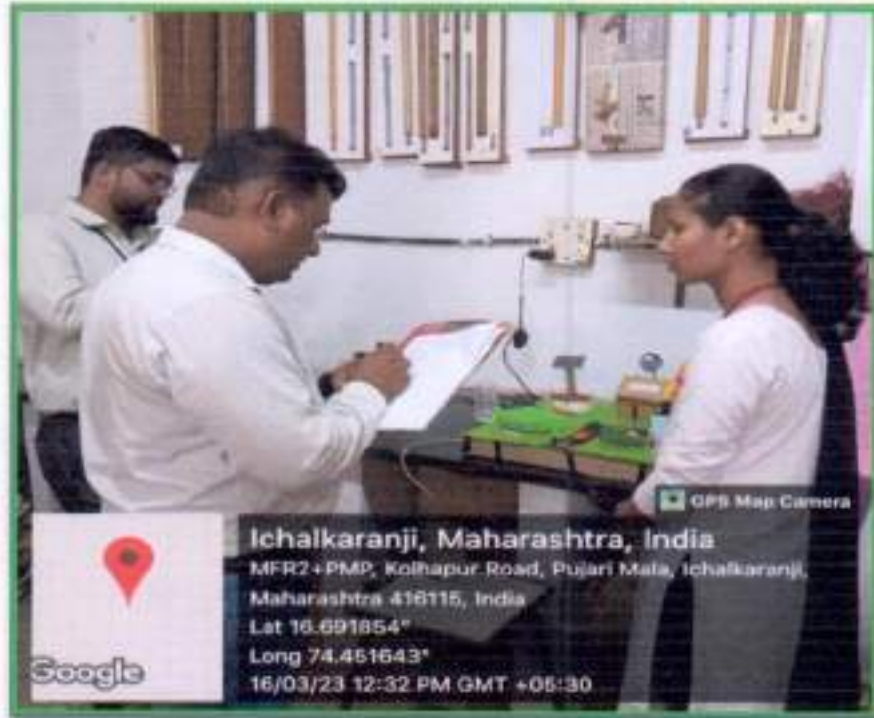
Referee assessing the models