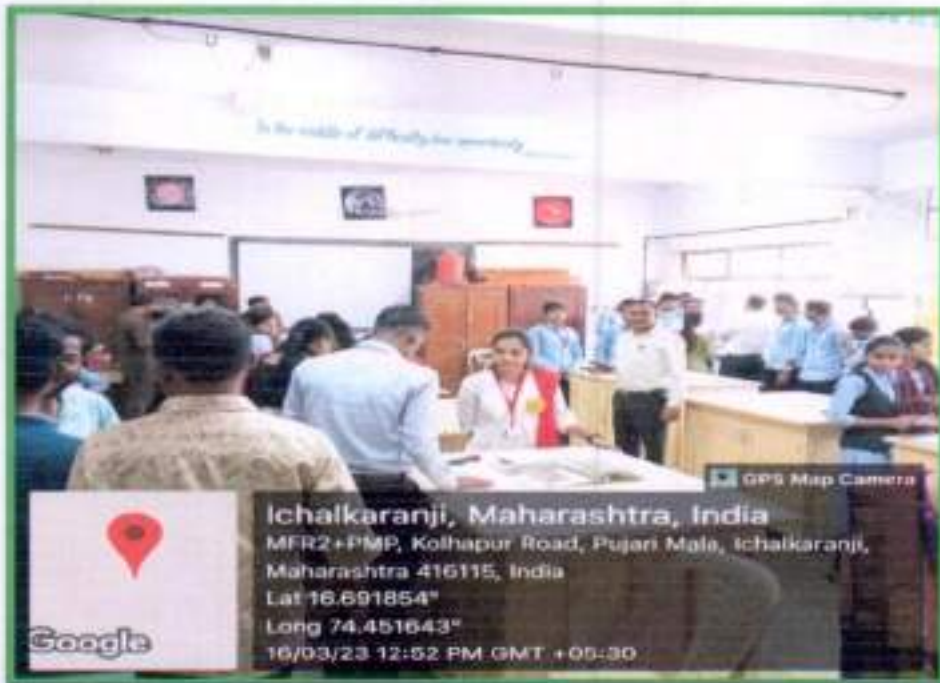
All students visiting the Science Fair