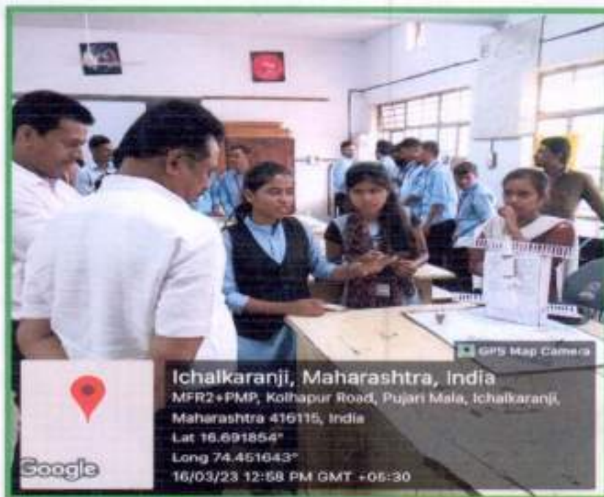
Students demonstrating models