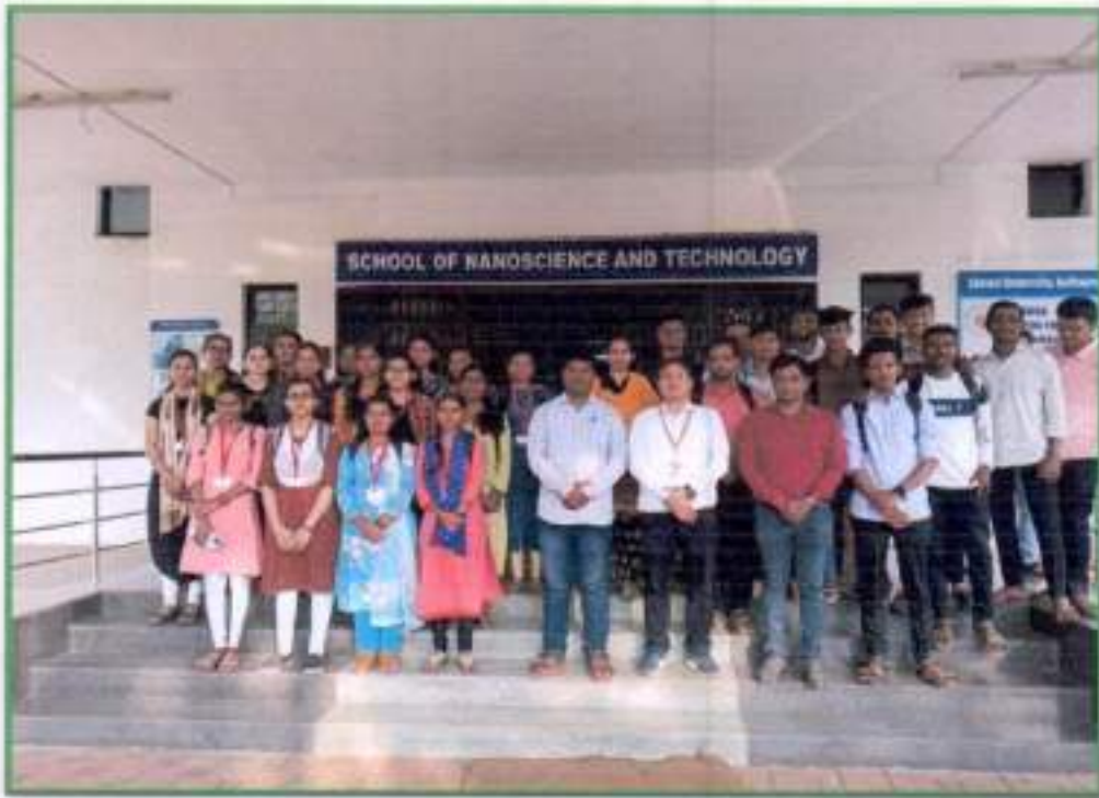
Visit at Shivaji University Kolhapur