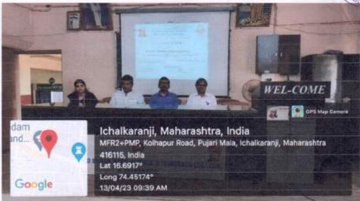
All dignitaries on the dais in the SIBIC career training lecture