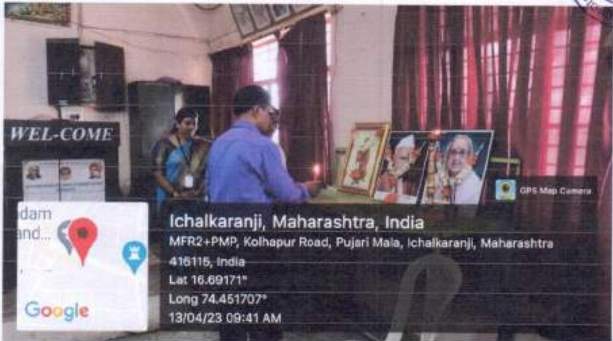
Chief Guest is lightning the lamp in the function