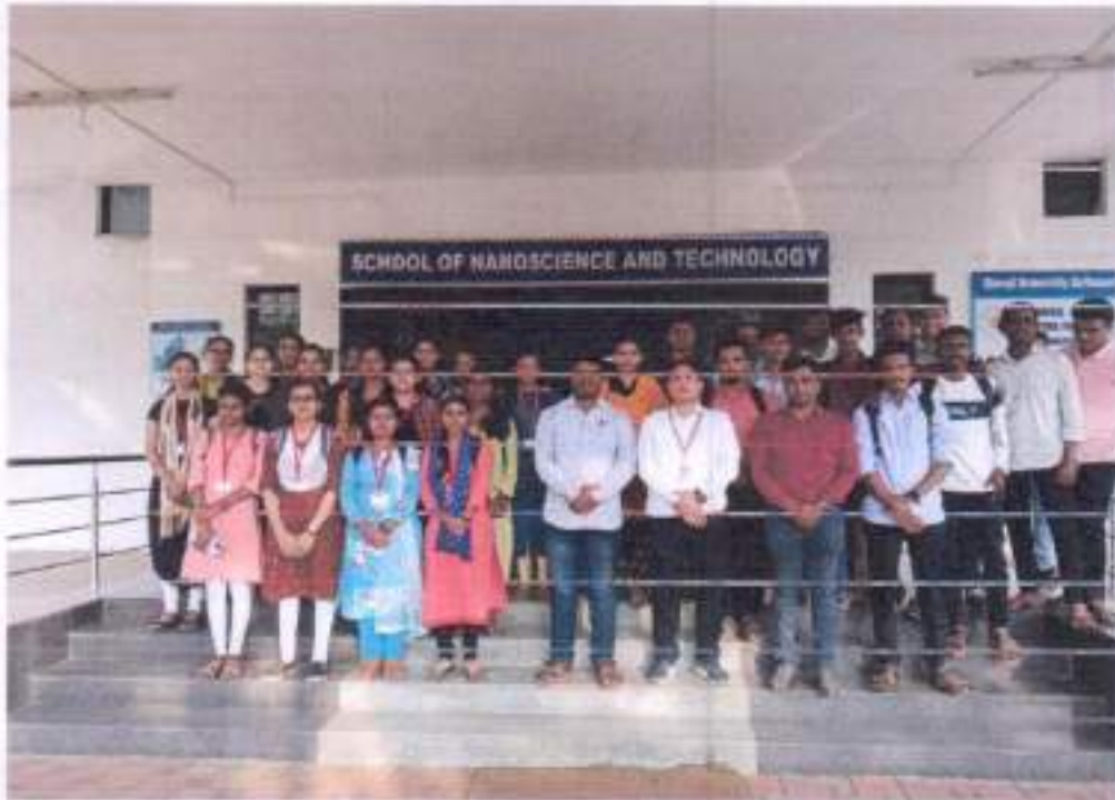
Visit at Shivaji University Kolhapur