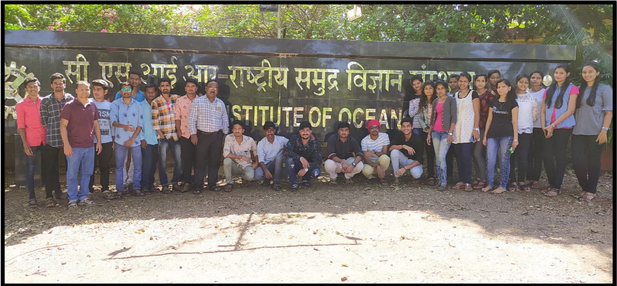
All students visited to NIO, Goa

Department of Electronics has arranged study tour activity for all B. Sc. Electronics students on 29 th January 2020.