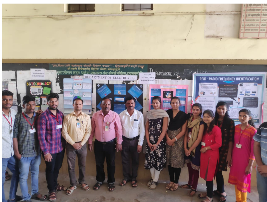
All Participants with Staff of Electronics Department