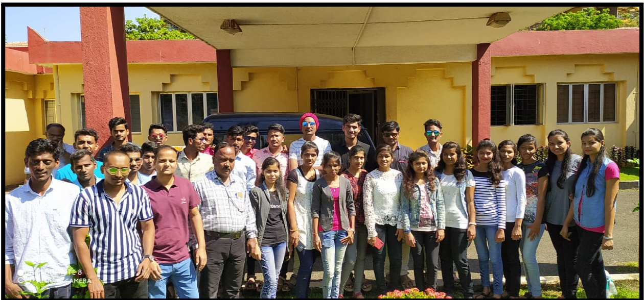
Visit to Goa Science Centre