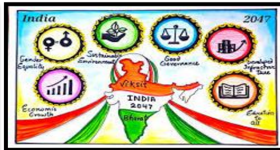
(Development of India picture :5-8)