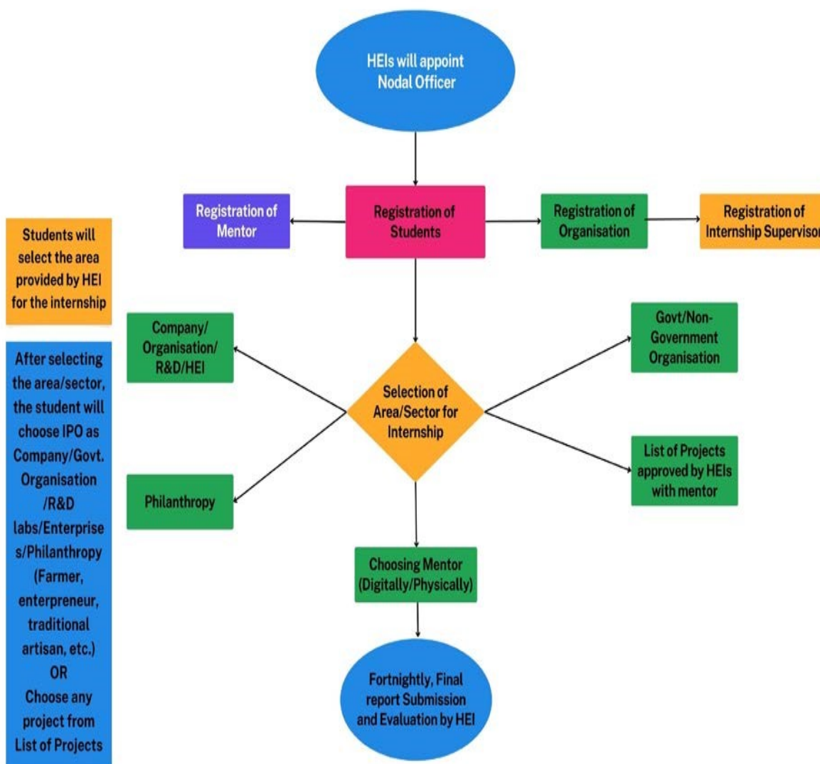
Figure 1: Operational Structure of Internship

HEIs should develop a roadmap for the smooth functioning of the internship programme through