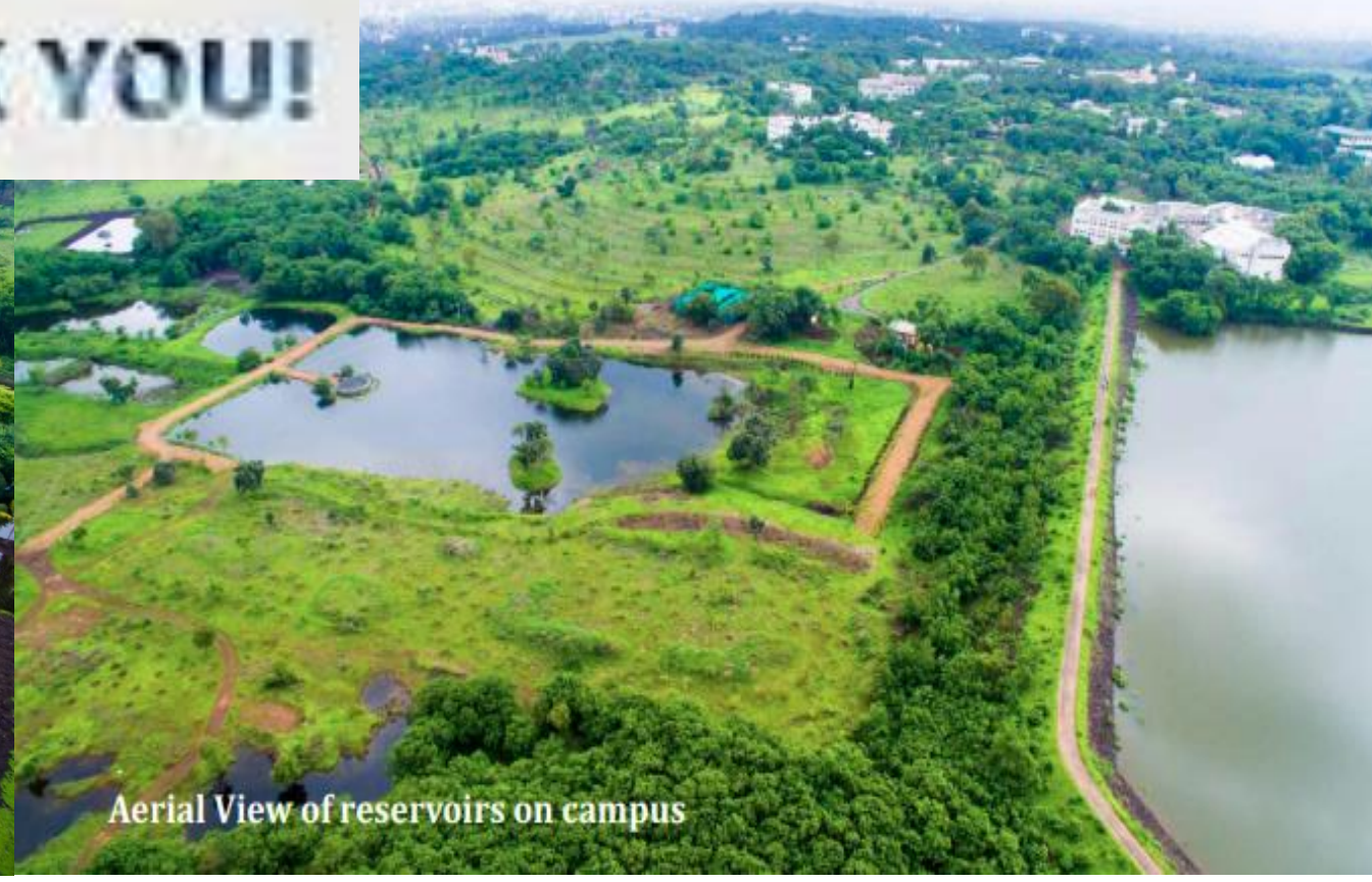
Aerial View of reservoirs on campus